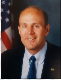
Mayor Jerry Edelen